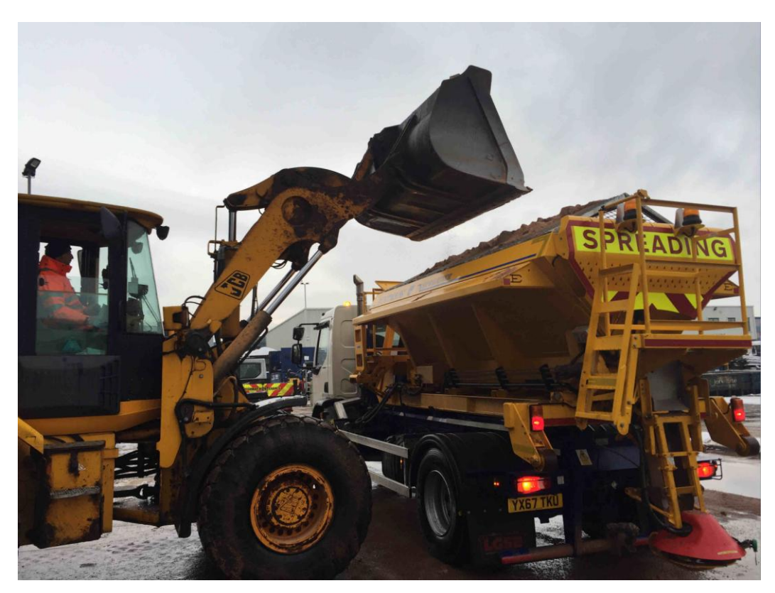
Gritting truck being filled up at Eco Depot

I would like to thank council officers who have worked hard over the winter to keep the city moving, and in particular during the late snows. A large number of teams across all departments have responded strongly to the challenges to maintain the provision of services to the public and in particular residents who depend on our services. I visited the team at the Peasholme Centre, and met with council staff and representatives from the Salvation Army who go out to meet rough sleepers on a regular basis to ensure that offers for accommodation and help are taken out into the street.